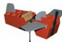
Flame red [2]